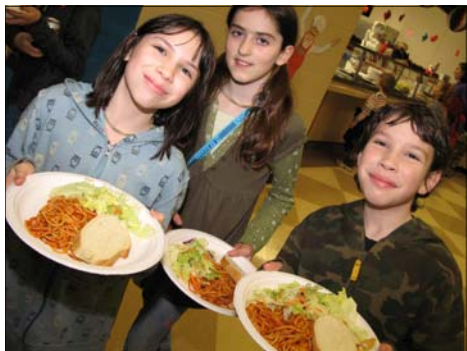
Over 600 people enjoyed the annual Booster Club's spaghetti dinner!

Spring pictures will be on March 12th for Wednesday kindergarten students and March 13th for other students. Only those students who purchase pictures will have their pictures taken.