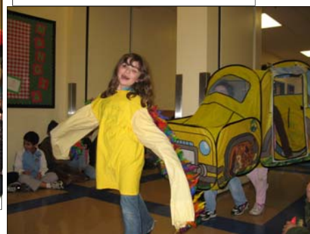
Parents, students and staff had a great time at our annual "I Love a Book Parade."