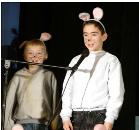
Second grade students presented "Of Mice and Mozart."