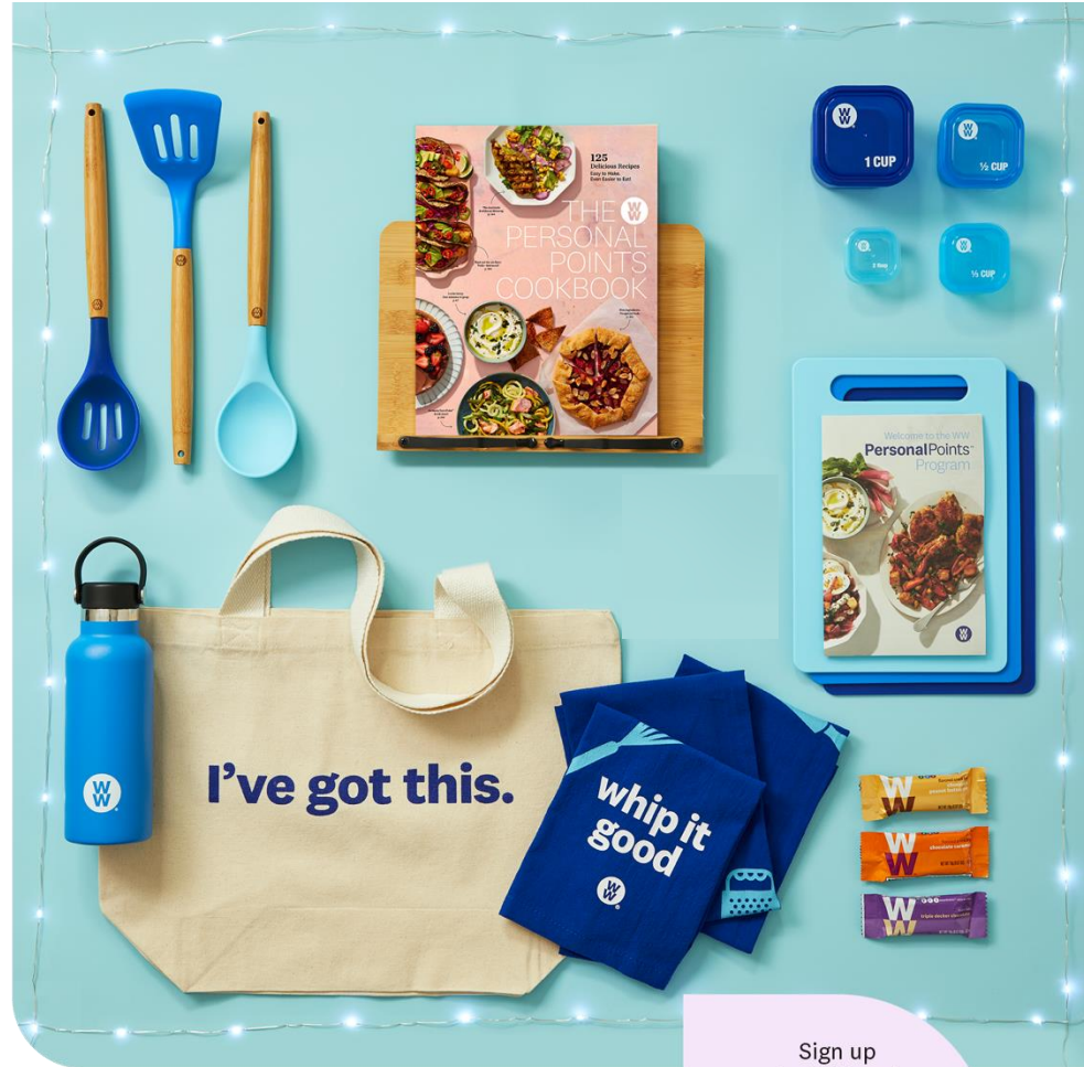
Kit contents may vary

Those weight-loss and wellness goals you've been waiting on? This is your year to reach 'em with WW's groundbreaking NEW PersonalPoints™ Program .